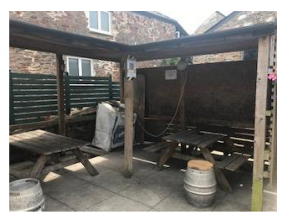
Sound proofing fence